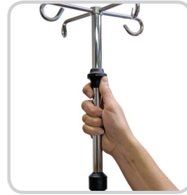
The pole height can be adjusted quickly & with ease