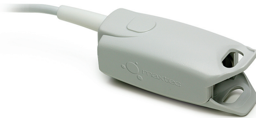
SpO 2 Finger Sensor 12 month warranty