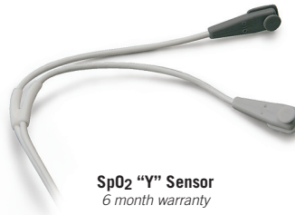
SpO 2 "Y" Sensor 6 month warranty