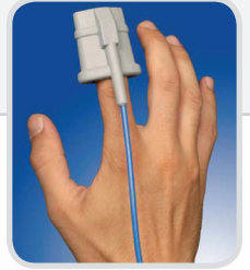
Large Soft Tip